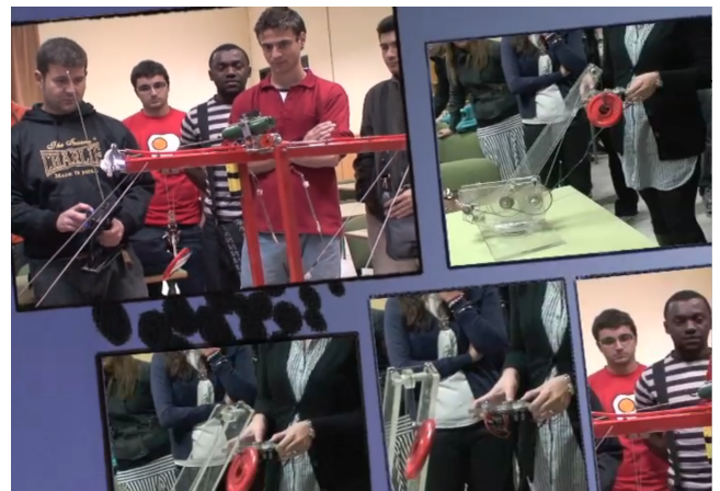
Figure 2: Frame from the DVD "La Maquina".

The students not only learned but enjoyed themselves. Subsequently, a DVD was published [Figure 2] with this experience, and some of the solutions that "Conceived, Implemented, Developed and Operated" have been used in later courses to explain the principle of the subject "Machinery and auxiliary means".