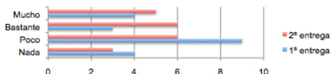
Figure 3: Engineering-related topics.

Regarding the problem to be solved, being free did not necessarily have to be related to engineering, however, it is observed that the issues related to it increase in the final installment (the 2nd) [Figure 3].