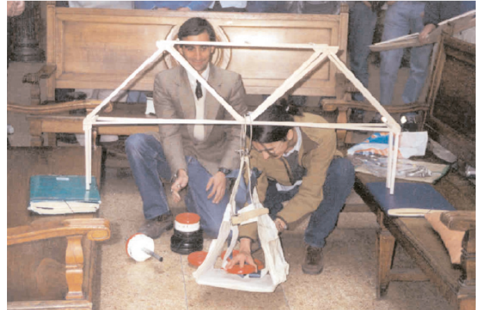
Figure 1: Cover image of the book "Tournament of structures".

work, affirming that it had helped them to learn and to consolidate concepts.