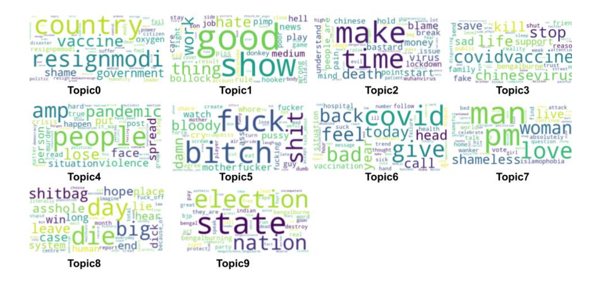
Figure 2: Optimal topics extracted from training set

2. Experiments: We use the python based Keras <sup>1</sup> library for its implementation. For the experiments, we perform 5-fold cross-validation on the training data, as the test data is unlabeled. For evaluation, we compute macro f1-score , and weighted f1-score to measure the performance of the model. We choose weighted f1-score as a metric because samples are unbalanced across various classes. We use the grid search to find the optimal hyperparameters for our experiments. We use Bi-GRU with 300 neurons each and set dropout to 0.3, batch size to 50 and the number of epochs to 5. We use ReLu as the activation function, Adam as an optimizer, and binary cross-entropy as the loss function. As first subtask (1A) is a binary classification problem, 'sigmoid' is applied for final prediction where we choose a threshold value of 0.5, whereas for the other subtask (1B) we use 'softmax' .