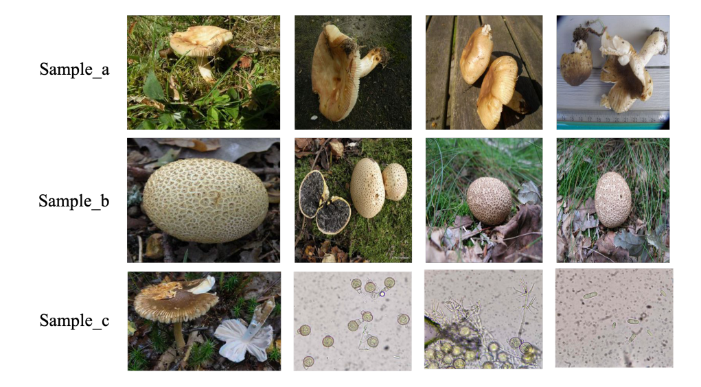
Figure 3: Selected test samples. We found many test samples contain several images, we predict the category of the test sample by averaging the model outputs of them. We also notice that some test samples such as sample_c contains one image pictured from natural environment, and the other images come from microscope view, it will disturb the average results.

Distinguish tail categories and open-set categories. We put the tail categories that are never been predicted by the model into hard tail categories, we argue that there are many hard tail categories misclassified as open-set categories. To deal with the problem above, we design the post process, refer to the Algorithm 1. From line 18 to line 27, to avoid the misclassification, we mining hard tail categories from top-3 predictions with low threshold filtering.