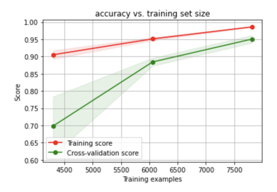
Figure 2: SVM + Tf-Idf + RandomOverSampler learning curve plot

In regards to traditional machine learning classifiers, SVM obtained the best performance. With the most optimal combination being: Tf-Idf for tokenization and RandomOverSampler for class balancing. This accomplished good model performance, evaluated on the test split from the train dataset provided by the organizers, with a 0.91 accuracy, 0.95 and 0.76 f1-scores for negatives and positives, respectively. This performance could be improved by a larger dataset since, as we can see in the learning curve plot from Figure 2, the model has yet to reach its full potential. Unfortunately, Spanish paraphrases corpora are very scarce.