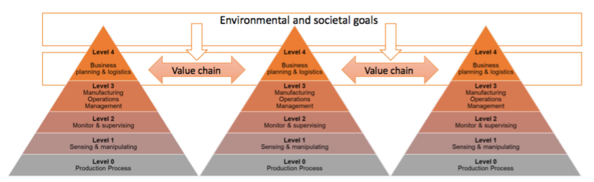
Figure 2 : Integration of automation pyramid in a broader scope where business decisions are able to include real-time value chain aspects and other global objectives such as societal or environmental ones.

The layered Industry 4.0 automation pyramid does not satisfy Industry 5.0 requirements. Specially those factors that are not directly related with the industrial process or regulatory constraints such as holistic environmental vision, bioeconomy interrelation along the value chain, etc. are out of the scope of Industry 4.0 and require a broader and interconnected suprasystem that is able to allow companies to modulate their decisions while maintaining their internal processes and KPIs (Figure 2). This Industry 5.0 suprasystem will require a completely new cognitive level that neither humans nor existing machines will be able to achieve independently.