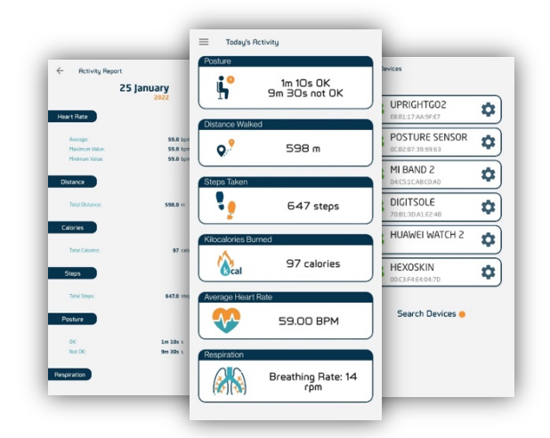
Figure 4: Screenshots from the Citizen Hub.

In addition to this, and demonstrating the cross-platform functionally, Citizen Hub is also being used for the pilot of the pilots initiative in the Smart Bear project [16], which has successfully integrated the Citizen Hub application in their cloud (exchanging data and functionalities). This demonstrates the potential of this interoperable solution to integrate any platform that is receptive or compliant with standardized data.