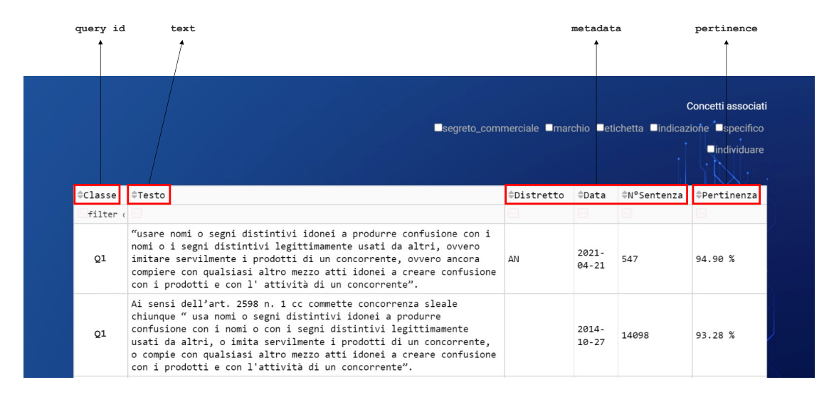
Figure 2: Example of the results retrieved over unfair competition dataset

Before proceeding further, a couple of remarks are needed. Each of the following retrieval tests has been performed on the original documents in Italian. For the sake of clarity and understandability, hereafter, some text translations, made by the authors, are provided to the reader. Furthermore, for brevity, below we report only on retrieved text chunks with the highest pertinence score.