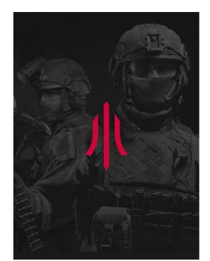
Figure 2: Website "Mini-Library of the Ukrainian Military" (https://tmg-training.org.ua/)

A new e-library created by The Mozart Group is rather unusual. In the summer of 2022, they launched a platform called "Mini-Library of the Ukrainian Military" (https://tmg-training.org.ua/) for defenders of Ukraine (Fig. 2).