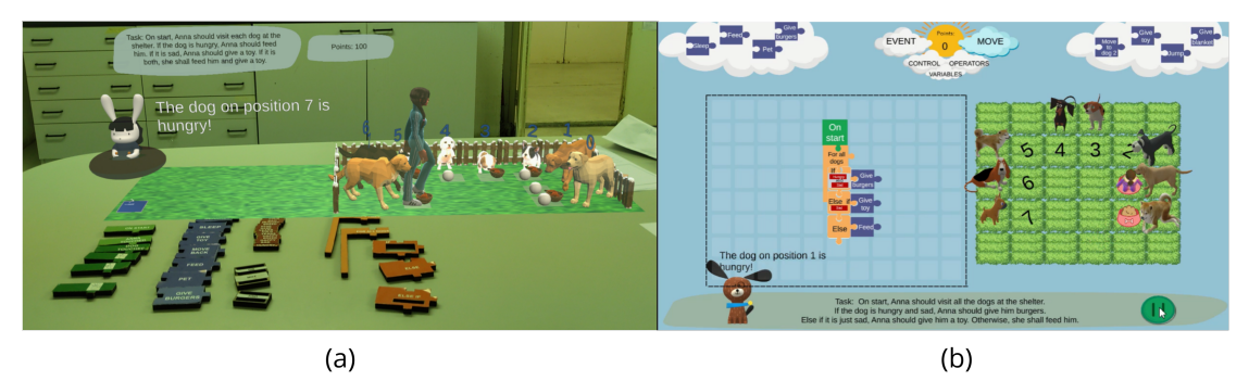
Figure 1: pARt Blocks (a) Tangibles+AR and (b) Desktop prototypes. Both show the blocks , a programming field (where users program with blocks), and a game field (where the results of programming are visible).

The key features of the application developed are the blocks , a programming field and a game field for two different applications we planned to compare – Tangibles+AR and Desktop – as seen in Figure 1. These elements are based on the prior work from Weerasinghe et al. [10].