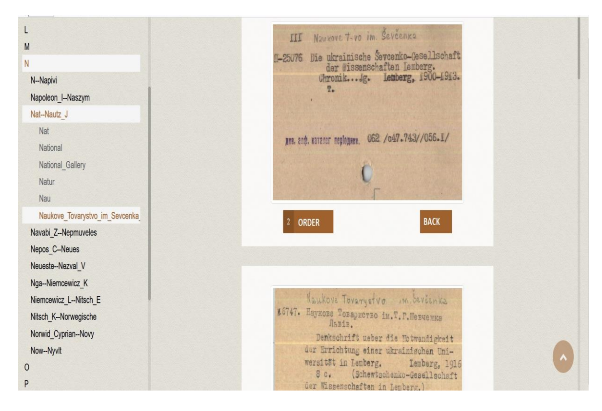
Figure 3: Screenshot from the electronic order from image catalog of Stefanyk LNNB of Ukraine.

not cause any difficulties. Thanks to the Circulation module of ABIS Aleph, the working group provides for electronic ordering of publications from funds where the book we need is stored. To create an electronic order in any of the catalogs, it is enough to go to the bibliographic description of the copy and select the "Order" option (Figure 3).