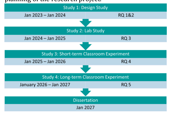
Figure 4: Planning

The data collection for this study will be done in collaboration with the research team in Radboud University. Teachers (n = 40) will be assigned to either no dashboard or classroom- and individual-level dashboard conditions. Classroom observations will be conducted to investigate teaches' strategy instruction at three timepoints (week 1, 3 and 6). Teachers' behaviour will be coded using ATES instrument similarly to Study 3. Figure 4 shows the planning of the research project.