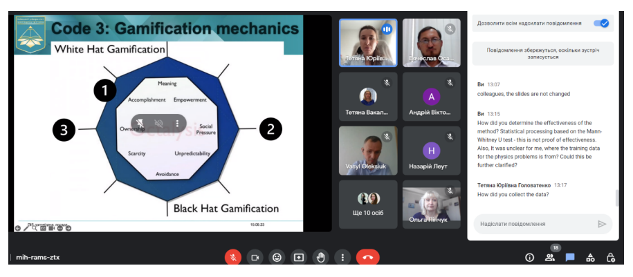
Figure 4: Screenshot during the report "Pre-service elementary school teacher perspectives on the use of digital gamification activities in language teaching".

DigiTransfEd 3: "Integrating digital technologies in teaching and learning" – reflects the scholarly interest of researchers in a wide range of initiatives, one of which involves the use of digital solutions in educational processes.