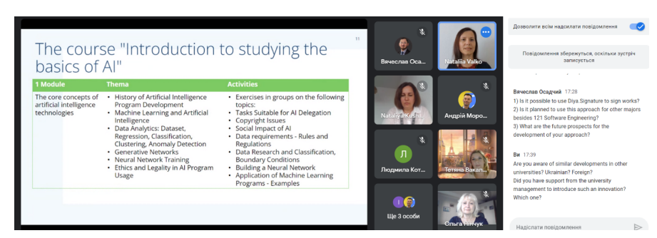
Figure 6: Screenshot under the report "Methodical aspects of studying artificial intelligence by future teachers".

tant. Traditional methods of preparing diploma papers can be expanded through innovative technologies. Application of virtual environments, online resources, and specialized software can make research and diploma paper preparation more accessible and effective. Methods and tools for conducting online defenses of these projects must be reliable and ensure an objective assessment of students' knowledge.