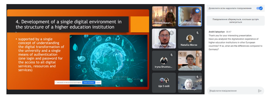
Figure 2: Screenshot during the report "Analysis of experience of digital transformation in education in Germany".

DigiTransfEd 1: "Digital transformation strategies for educational institutions " comprises articles that deeply explore and analyze digital transformation strategies at educational institutions.