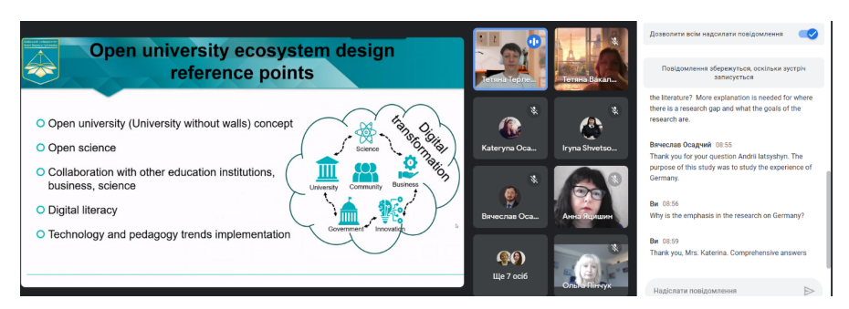
Figure 3: Screenshot during the report "Theoretical exploration of university ecosystem design under conditions of digital transformation".

Research that explores effective ways to create and sustain interactivity and collaboration between teachers and students in digital learning environments, along with examples of successful practices in the implementation of digital tools in education that promote active student engagement.