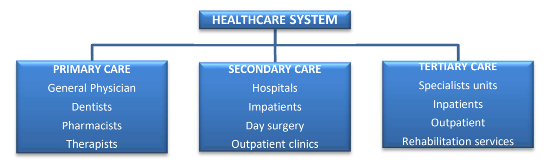
Figure: 1 Domains of Healthcare [2]

Healthcare is growing at an exceptional rate because of the aging population, lifestyle diseases, demand for affordable healthcare services, increasing awareness towards health, attitude transformation towards preventive healthcare, advancement in the area of healthcare technology, continuous health insurance penetration, and initiatives taken by the government are driving the healthcare sector. Healthcare can be segmented into three broad domains i.e. primary care, secondary care, and tertiary care. Figure: 1 presents the different segments of healthcare along with the care given in each segment.