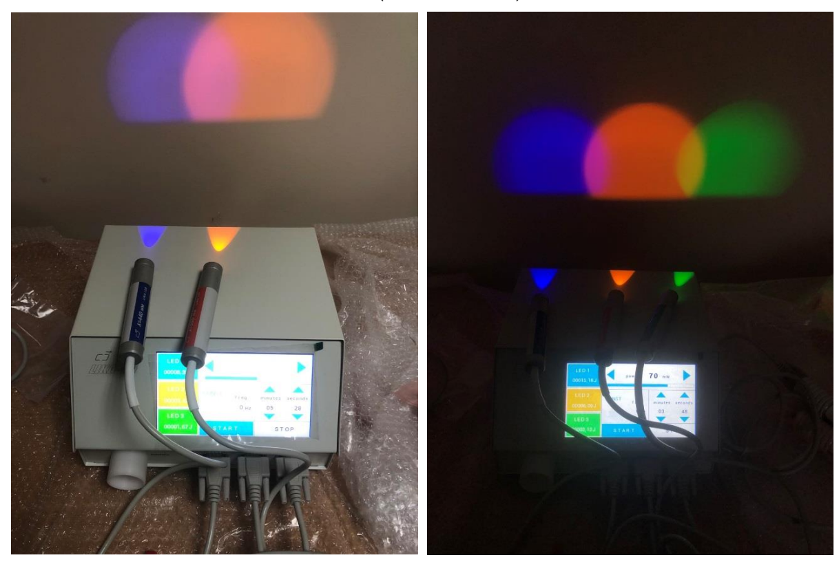
Figure 2. Setting up the Lika-Led device