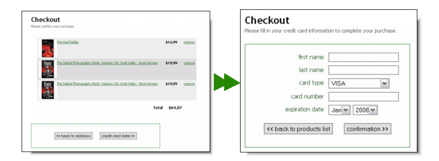
Fig 2. UI mockups for steps 2 and 3 of the checkout process.