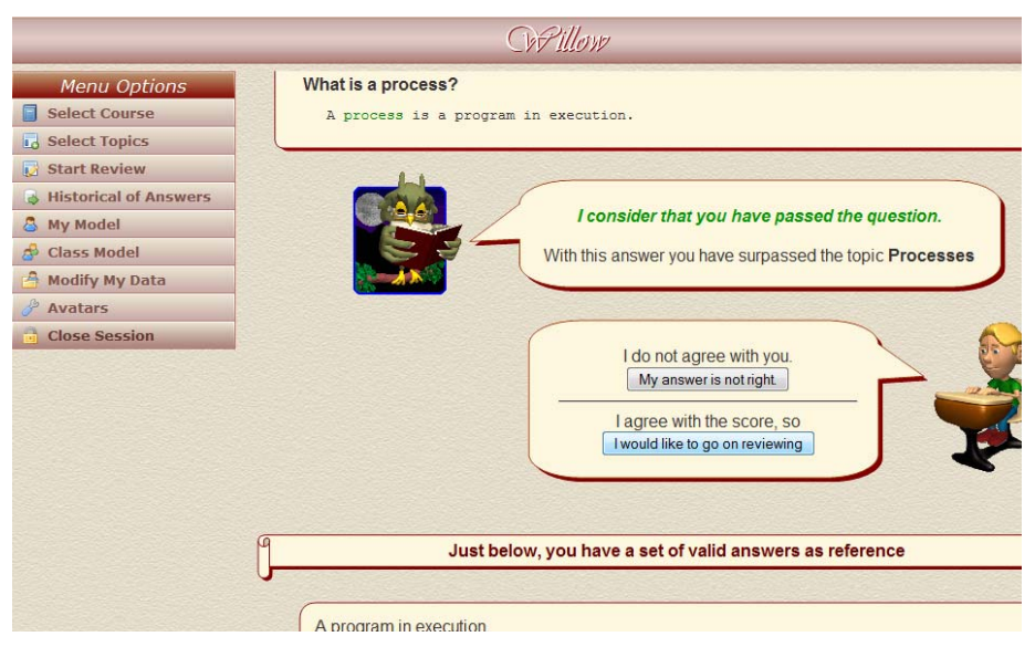
Figure 2. Sample snapshot of Willow providing feedback to the student.