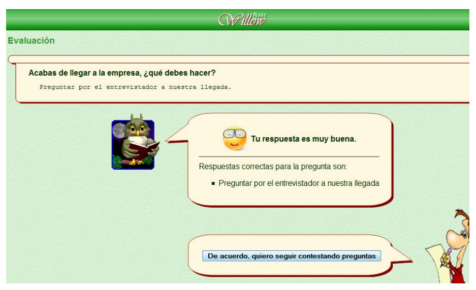
Figure 4. Sample snapshot of Willow ALADE providing feedback to the student (the answer translated from Spanish into English is "To ask for the interviewer when we arrive" ).

Whenever a student click on the "Evaluate answer" button, the feedback page is generated as in Willow. However, the difference is now that the self-assessment feature is removed, as it is no longer necessary. Given that the student writes one of the possible answers from the list provided, the assessment of the answer does not have any difficulty, as it is just a comparison between two sentences that should be equal to pass the question (taking into account that no penalization should be applied because of bad orthography as the teachers advised us).