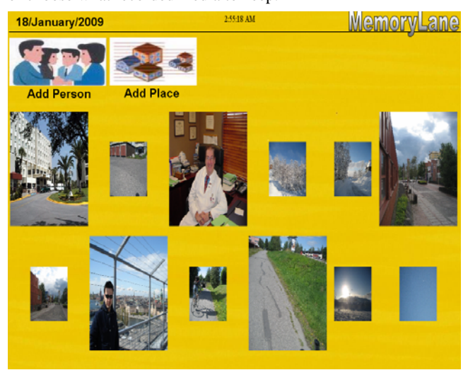
Figure 3. The Activity review interface

On a more detailed level shown in Figure 3, the Review Client visualises an Activity, with the detected Place, Persons and Items at the time, as well as a filtered selection of recorded media. The users can then set or change the Place, add and remove Persons, or choose what recorded media to keep.