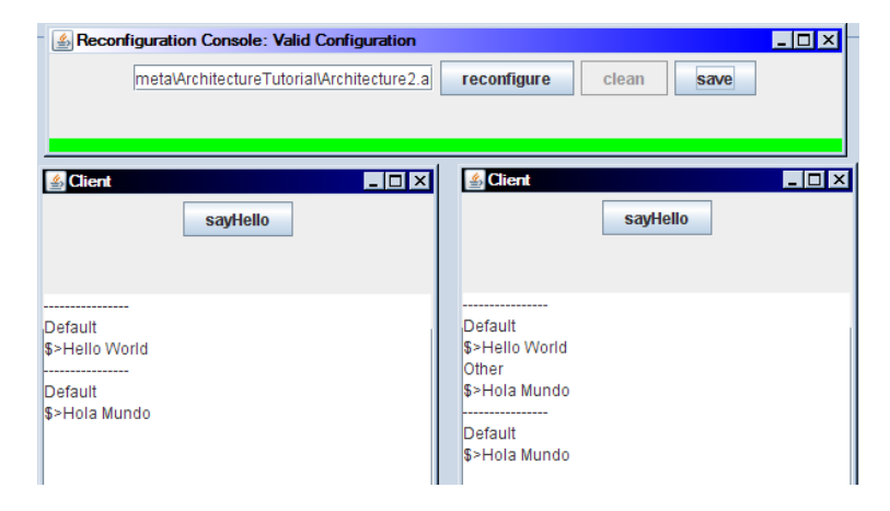
Fig. 1. Two clients after the initial deployment and a reconfiguration

Each client component is associated with a GUI: a window composed of a button and a text area. By clicking on the button, the client component simply asks the default server to say hello and, if any, all the other servers to also say hello. The results are printed in the text area, as illustrated in Figure 1.