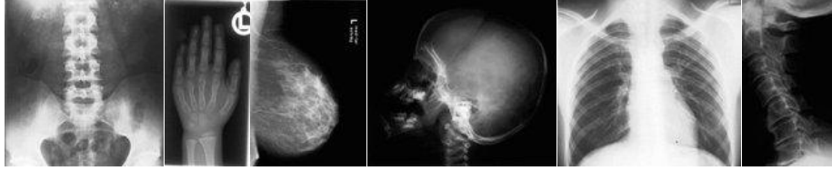
Figure 2. Example images (IRMA). Left to right: abdomen, limbs, breast, skull, chest, spine.

used here to obtain an efficient approximate search that can easily cope with very large sets of reference vectors at significantly lower runtime.