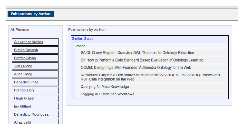
Figure 2 – User-friendly interface with All Persons and Selected Person Co-Workers.

The development interface of RExplorator is best suited to allow users to explore RDF repositories, and requires understanding the RDF model. RExplorator allows expert users to provide an end-user friendly interface – called the Application Interface - to solutions found while exploring datasets. This interface is generated by a combination of views, which are defined using the "views" menu option; generic, pre-defined views are initially available for reuse. Views make full use of CSS, which is also defined in a separate view that can be customized to change the look-and-feel of the generated interface. Figure 2 shows an example of an application interface.