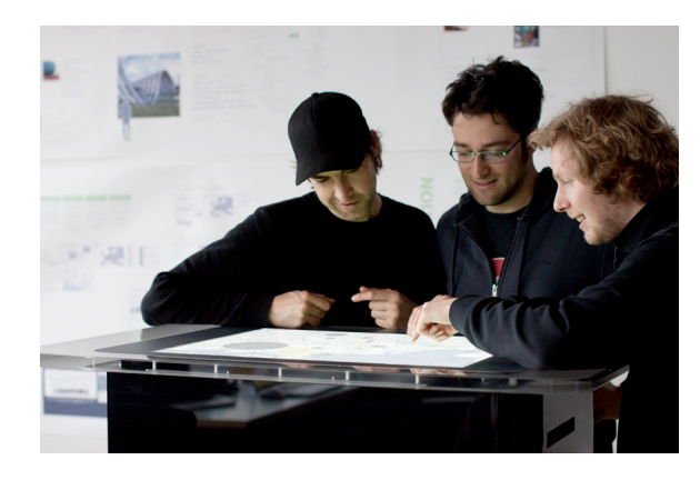
Fig. 2. Users exploring institutions with the tabletop prototype.

With the large interactive surface, the user not only views and manipulates data on a single user system, but operates in a collaboratively created and used information space (see Fig. 2). In this setting, co-located users, who may or may not be associated with each other, explore the visualization together. Users can arrive or leave at any time, and have the ability to interact as an individual, or as a member of a group with similar interests, goals or attitudes. Cooperative interaction can involve periods of tightly coupled activities by groups with similar but diverging goals, alternated with more loosely coupled individual work. Such collaborative threads can close, split off and merge repeatedly.