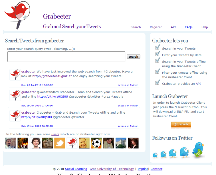
Fig. 2. Grabeeter Web Application

Due to Twitter's REST API Limit<sup>10</sup> it is only possible to access the latest 3200 tweets (statuses) via the API of a given user on Twitter. So in case a user has less than 3200 tweets on Twitter at the time of registration on Grabeeter all of the user's tweets are archived. From that time on all future tweets are stored and the entire first (3200 or less) tweets remain accessible and searchable too. In that way all tweets of a user ever become saved and searchable. If a user has more than 3200 tweets on Twitter at the time of registration on Grabeeter it is only possible to retrieve the latest 3200 tweets of this user from Twitter due to the Twitter limit. But from that time on all of the future tweets are archived and searchable through Grabeeter.