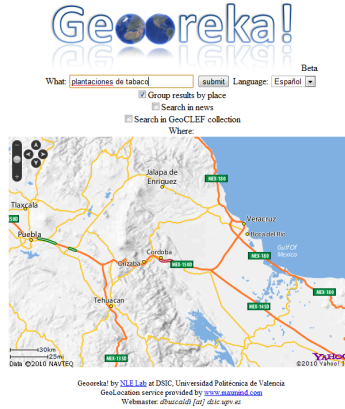
Fig. 1. Main page of Georeka!

web counts are calculated using the static Google 1T Web database 5 , indexed using the jWeb1T interface [8], whereas Yahoo! Search is used to retrieve the results of the queries composed by the combination of a theme and a toponym.