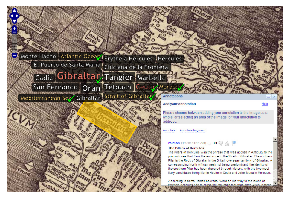
Fig. 3. Adding semantic links to annotations (example uses Geonames and OpenCalais). Source material: Martin Waldseemüller, 1507, Universalis Cosmographia<sup>18</sup> (map); Pillars of Hercules Wikipedia article<sup>19</sup> (text).

font than less relevant suggestions. (For example, Geonames sorts results by population and filters out smaller places that are in the vicinity of larger places; Yahoo! Shortcuts and OpenCalais both provide an explicit "prediction probability" or "relevance score", respectively.)