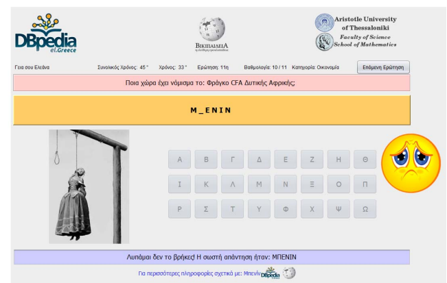
Figure 3: Hangman with feedback links.

At the end of the game, a file with all questions and correct answers, the time spent and results is created for future