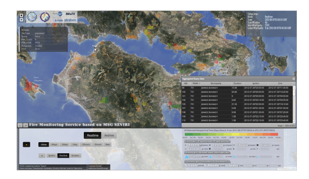
Fig. 2. The NOA fire monitoring application GUI