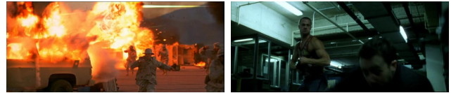
Figure 1: Example frames of violent scenes in movies.