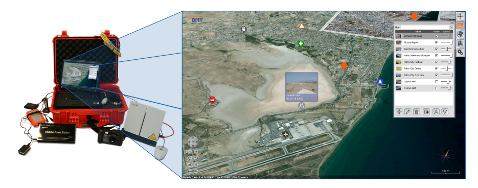
Fig. 1. DMT hardware and user interface.

vast amounts of information and cognitive resources from crowdsourcing and social networks, we are also concerned that exactly these assets are likely to be affected and potentially unavailable in disaster situations. Hence, our research focusses on how to use these technologies without critically relying on them. In previous work we have investigated the specific requirements for a tool to assist disaster management [5]. In the following paper we report on our work towards a software prototype that helps to study how experts use such a tool under field conditions. We briefly describe the application domain the system is intended to be used in. We describe the functionality and the system architecture of the DMT. Finally, we present and discuss evaluation feedback of users who worked with the DMT during several training missions.