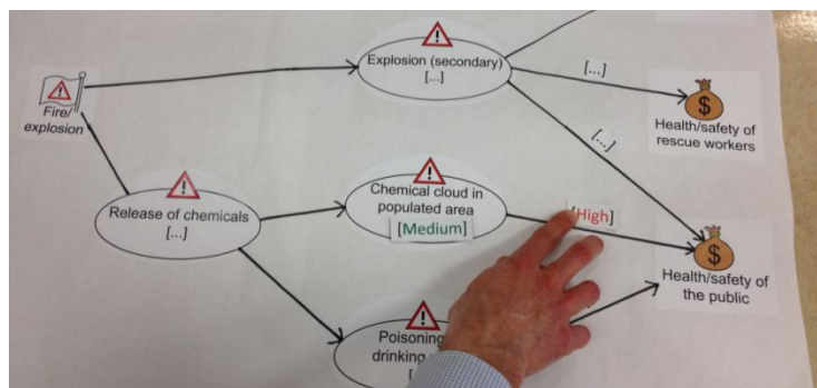
Fig. 1. Paper prototype of the BRA demonstrated at the evaluation workshop

Following the strategy of a lightweight approach to the first iteration, the first artifact was developed as a paper prototype [20] of an application to be deployed on an interactive multi-user touch table. Paper prototypes can be developed with little resources, while still providing a good basis for discussions and feedback. Fig. 1 shows a picture of a part of the paper prototype. Although it aimed to fulfill all the requirements above, space restrictions mean that we must limit ourselves to explain some of the central aspects.