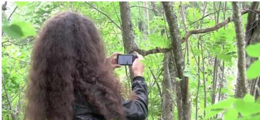
Figure 1: Student interacting with a mobile device in an outdoor environment

The main reasons for introducing mobile devices to learning activities outside the classroom is that it enables new learning experiences, since it can place learning in authentic contexts, support peer collaboration, and motivate learning (Wijers, Jonker, & Drijvers, 2010). Simultaneously, one challenge of introducing mobile devices to learning activities is that the novel technology might detract from the new learning experiences (see Figure 1 ). This is the challenge focused upon in this thesis. We approach this challenge from a human-computer interaction perspective, where we arrive at a model for designing formal learning activities outside the classroom through an iterative process of design and analysis.