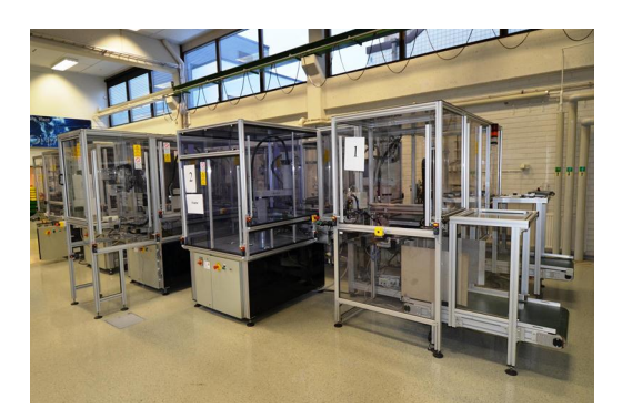
Fig. 6. Production line.

As most of the data generated by the application relates to energy consumption of the ballasts and their operating modes, it can be included in energy monitoring applications as a separate set of parameters as well as a component of a composite key performance indicator (KPI) e.g. total energy consumption of the site. For the discussed case-study the site consists of the testbed depicted in Fig. 1 and the neighbouring facilities of the Factory Automation Systems and Technology laboratory hosting the production line (Fig. 6.). The line consists of 10 manufacturing cells, each containing at minimum one robot and a conveyor system. The line is capable of drawing 729 different layouts of mobile phones, using different combinations of frame, keyboard, and screen types. Cell 1 is in charge with determining whether incoming pallets are occupied with finished products and they need unload to be performed on them, or they need further circulation in the line. Quality inspection takes place also here via a machine. The buffer is implemented at Cell 7.