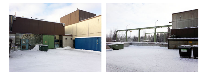
Fig. 1. Views of the testbed area: view to the front wall with access doors and legacy lamps mounted and a view to the parking area.

In addition to the abovementioned problems, the existing lighting installation lacks energy efficiency due to the type of lamps used, applied control strategy and lack of dimming capabilities. These obstacles are easily overcome by migration to LED lamps with ballast offering dimming functionality, which is expected to turn into even bigger savings as cold climate prevents overheating of the diodes.