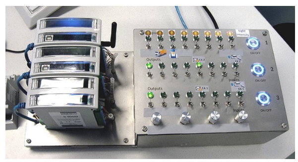
Fig. 5. Evaluation testbed.

The abovementioned criteria are applied to each phase separately, as different lamps connected to same analyzer may be set to different operating modes in certain lighting scenes.