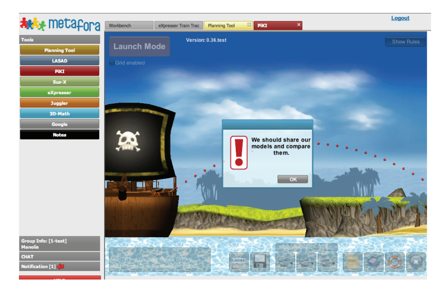
Fig. 2. Once a message is sent, it appears as pop-up anywhere that the students are working. In this case, a student is investigating their PIKI construction without much attention to the work of the rest of the group, and another student requests that they share and compare their work.