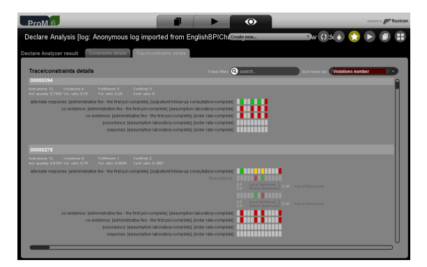
Fig. 3. Screenshot from the Declare Analyzer.

The Declare Replayer and the Declare Diagnoser (Declare Checker package) can be used to check the conformance of the actual behavior of a process as recorded in an event log with respect to a reference Declare model. The Declare Replayer generates a set of alignments between the log and the Declare model, i.e., information about what must be changed in the log traces to make them perfectly compliant with the model. The Declare Diagnoser projects the results obtained through the Declare Replayer onto the reference model (as shown in Fig. 2). This projection produces a map in which the critical activities/constraints of the reference model are highlighted. In particular, activities are colored from red to green according to the number of moves they are involved in, i.e., according to how many times they were in the wrong place in the log or missing when required. Constraints are colored from red to green based on the number of moves that are needed to make the log compliant to them. Through the Declare Analyzer (Fig. 3), the user can pinpoint where the process execution deviates from the reference Declare model and quantify the degree of conformance of the process behavior through several metrics, e.g., fulfillment ratio and violation ratio.