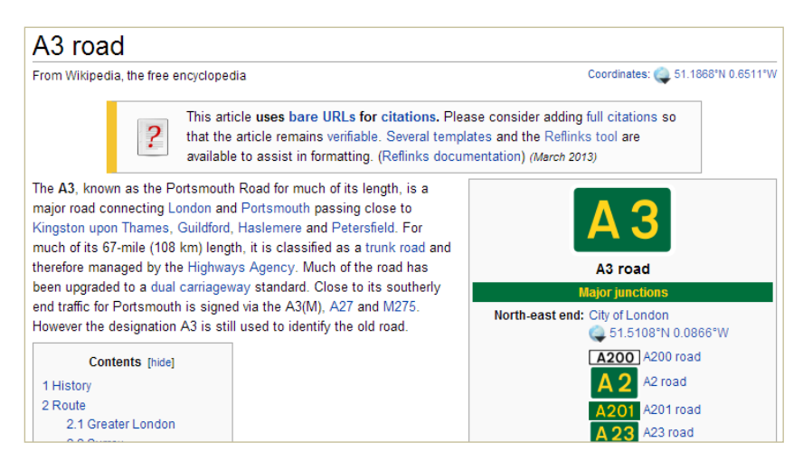
Fig. 2. Example of an article with a cleanup task that suggests users to add verifiable references to meet the quality standards of Wikipedia.

There are also domains specific properties that can be used to describe SLUA instance, as exemplified later in this paper.