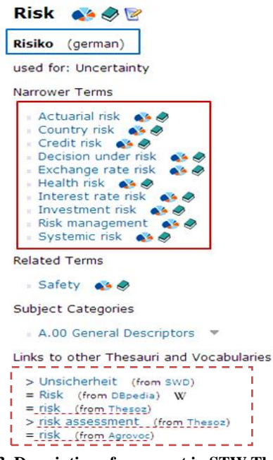
Figure 3. Description of a concept in STW Thesaurus.

Using different concepts we get different results. Thus, the combination and the number of the concepts determine the quality of the retrieved results.