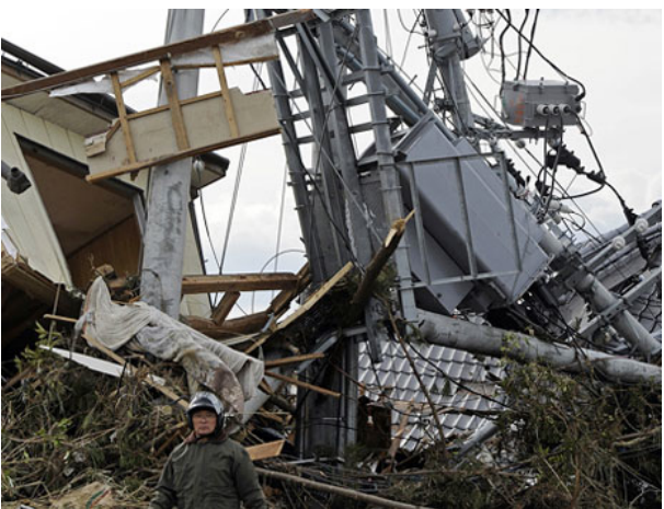
Fig. 2. The Great East Japan Earthquake of 2011. Internet connectivity was almost unaffected by the catastrophe. Access of data from remote could be possible in case of natural disaster.

• Ensure data access in case of emergency: standardised electronic data could be accessed from remote and this could be extremely important in particular situation such as natural disasters or a patient emergency. Unique health records that are not connected to a network of institutions are exposed to natural disasters. The Great East Japan Earthquake of 2011 revealed the vulnerability of the existent data storage system and the lack of an integrated health data management. In addition, personal medical records accessibility could be determining in case of emergency, allowing different care providers to access the patient personal records [1].