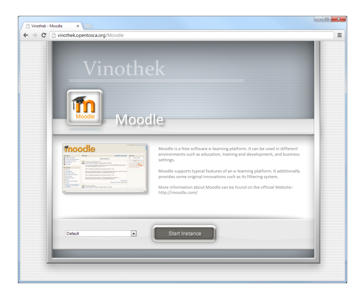
Figure 2. Vinothek Application Details page showing the selected Moodle application