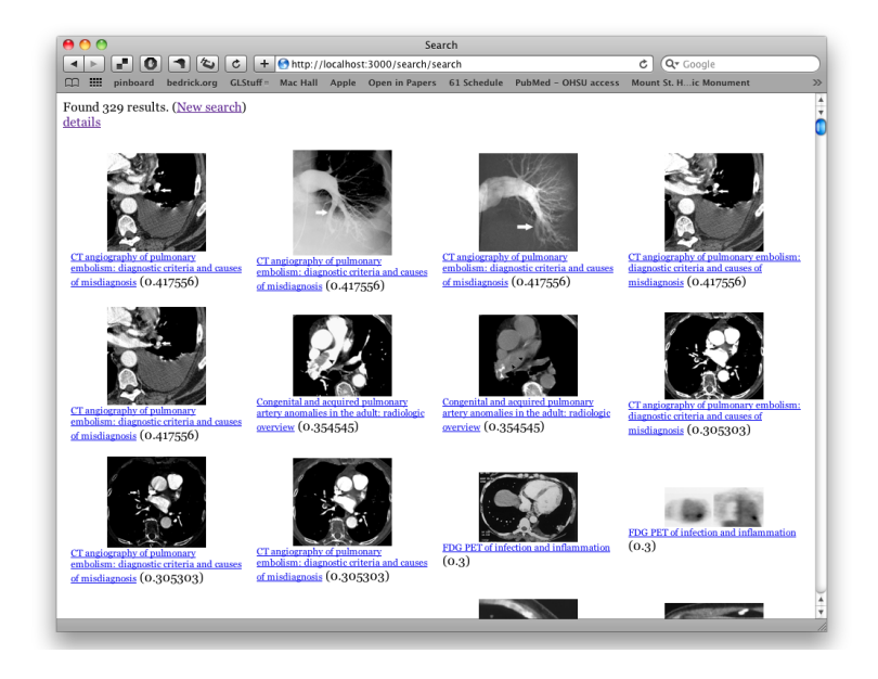
Fig. 2. The system's main search results screen. Clicking on a single result takes the user to a full page with details of that specific image.