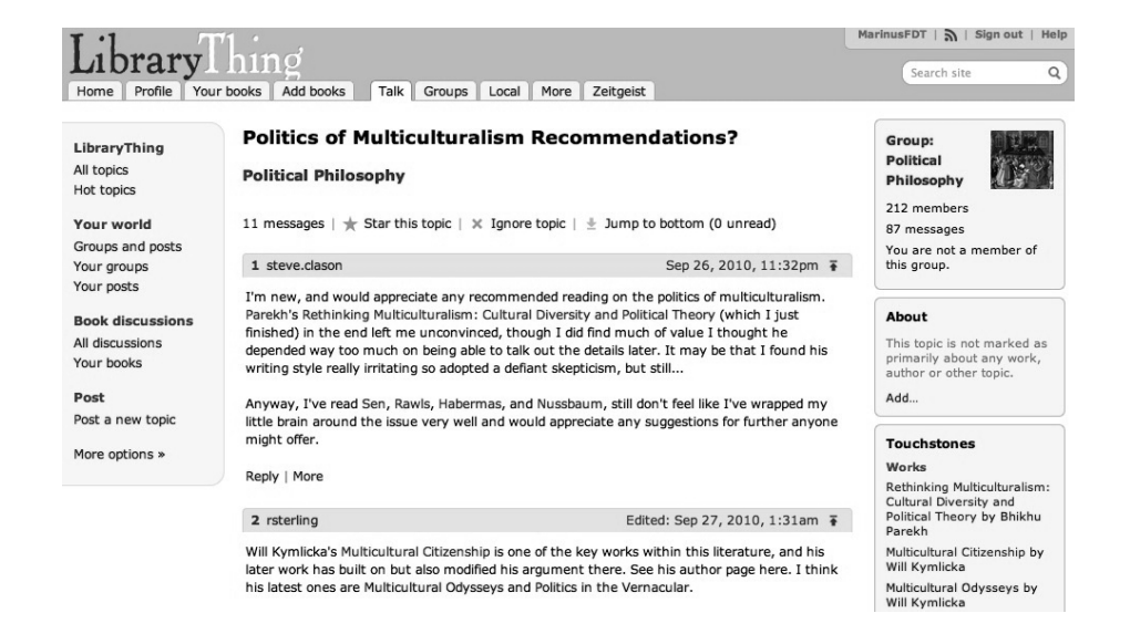
Fig. 1. A topic thread in LibraryThing, with suggested books listed on the right hand side.

the information need if the full-text index found it least one suggestion in the top 1000 results. This left 6510 topics. Next, we used short regular expressions to select messages containing any of a list of phrases like looking for, suggest, recommend . From this set we randomly selected topics and manually selected those topics where the initial message contains an actual request for book recommendations, until we had 89 new topics. We also labeled each selected topic with topic type (requests for books related to subject, author, genre, edition etc.) and genre information ( Fiction, Non-fiction or both).