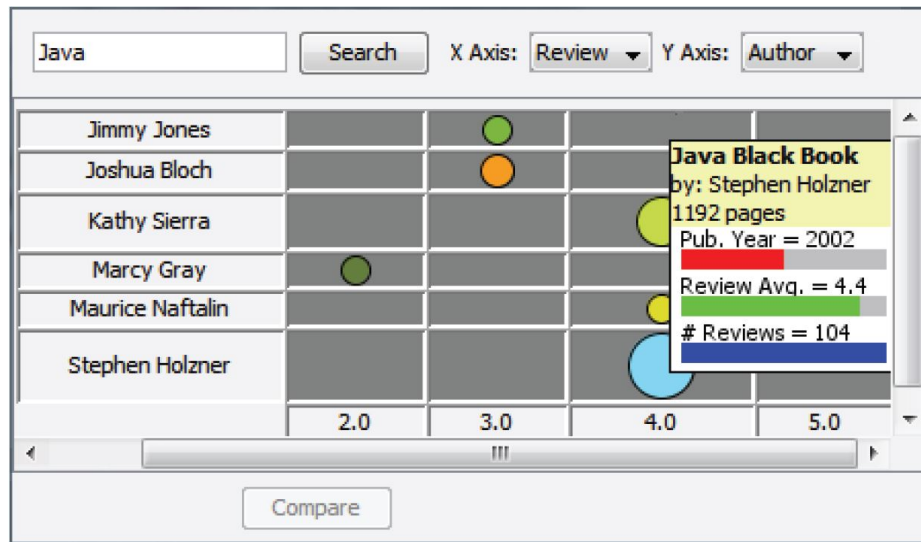
Fig. 2. Result list overview in the VIDLS system

The main aim of the study was to assess the usability of the visualizations. Therefore A/B testing with a within-subject design was used. This was in a laboratory environment. The study was divided in multiple sessions each with three to five students. The only task was to search for books, once with both systems, the text-based system and the VIDLS system. A post search survey was used to assess the usability by asking the users about their impressions on the system. No details on the corpus are provided.