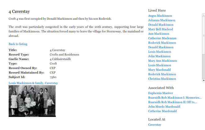
Figure 1: Details of a croft

CURIOS allows users to browse and update their linked data in a triple store directly without transforming RDF triples to Drupal content and vice versa. A CURIOS record consists of a set of RDF triples where the subject is a unique URI representing the record identifier. For browsing, depending on