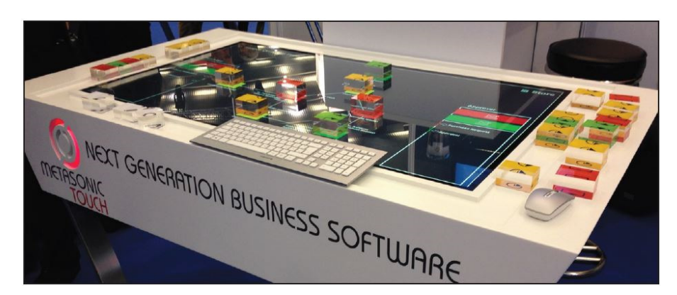
Fig. 1. Overall view of Metasonic Touch

Modelling Bricks. Metasonic Touch uses six types of modelling bricks, including three bricks representing S-BPM process elements (see [3] for details), and three bricks representing tools for modelling, as shown in Table 1. Every brick has on its bottom side a unique visual marker that can be recognized by the cameras built in the display.