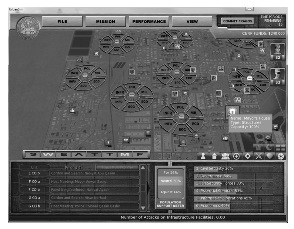
Fig. 1. UrbanSim

where the available information is often overwhelming, but at the same time may be incomplete. In other words, students should realize that their decisions produce intelligence that may be critical for decision making and planning during the next set of turns. Students can learn about the effects of their actions by viewing causal graphs provided by their security officer (S2). Users who adopt strategies to better understand the area of operation and its culture by viewing and interpreting the effects of their actions using these causal graphs should progressively make better decisions in the simulation environment as the COIN scenario evolves.