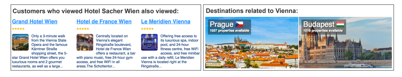
Figure 1: Examples of recommender systems on Booking.com. User-to-user collaborative filtering (left): recommend accomodations viewed by similar users to a user who just looked at 'Hotel Sacher Wien'. Item-to-item content-based recommendations (right): recommend destinations similar to a particular destination, Vienna.

downs can happen more frequently and rapidly for users who book accommodations for different travel purposes, e.g. for leisure holidays and business trips as shown in Fig. 2 (bottom). These continuous cold-start problems are rarely addressed in the literature despite their relevance in industrial applications. Classical approaches to the cold-start problem fail in the case of CoCoS, since they assume that users warm up in a reasonable time and stay warm after that.