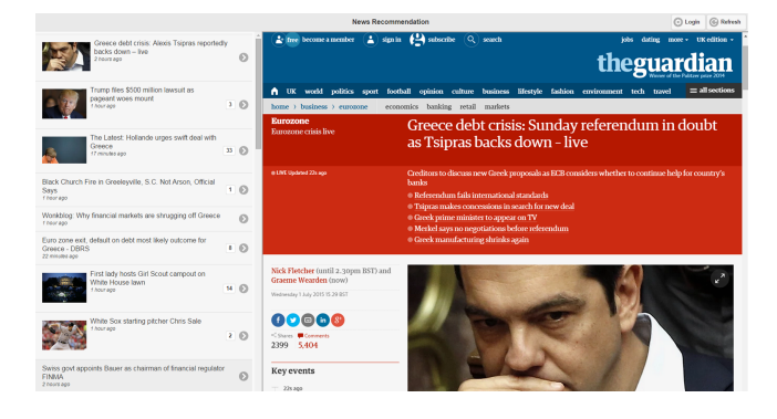
Figure 2: A screenshot of the user interface of the (mobile) web application.

Explicit feedback for news services is difficult to interpret and therefore less common. E.g., a 1-star on a 5 point rating scale can be interpreted as a disinterest for the content, or as sympathizing with a story about some tragic event. Therefore, our system is using implicit feedback based on the user's viewing behavior. If an article is selected and shown on the screen for at least 10 seconds, we assume that the user has some interest in the topic of the story.