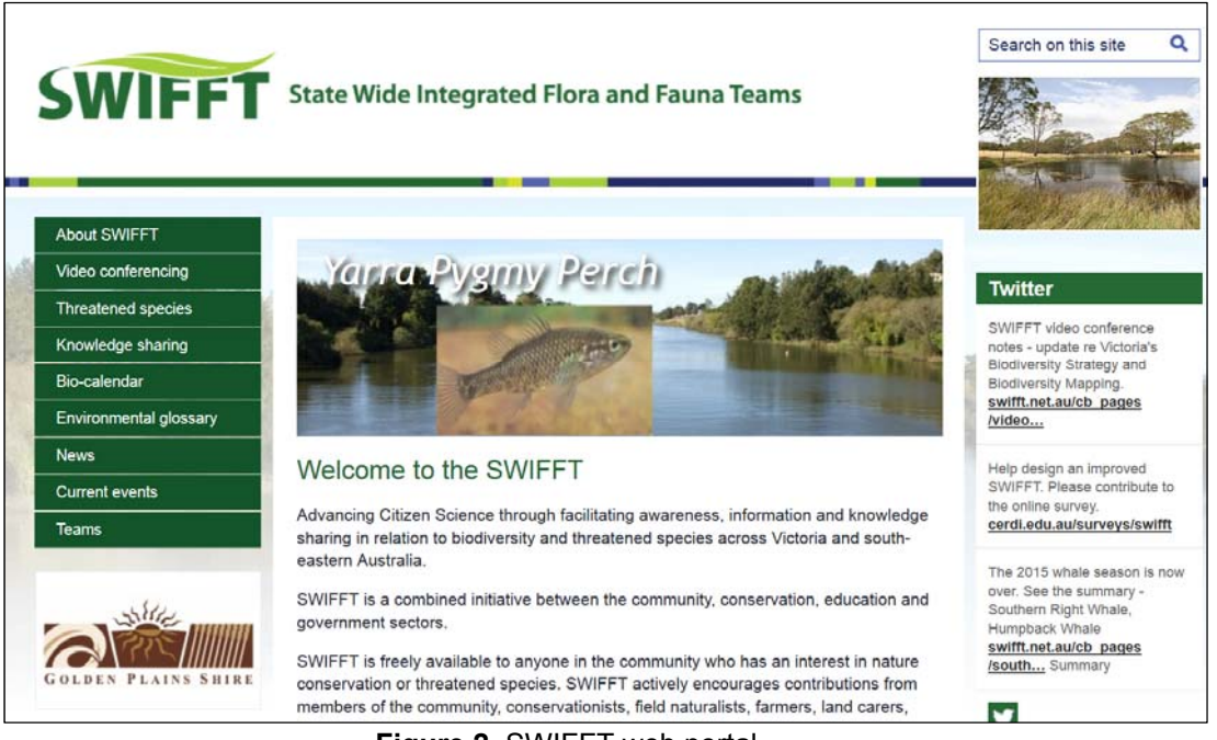
Figure 2. SWIFFT web portal

Knowledge sharing also occurs through video conferencing but options for supplementing the current video conferencing model with webinars are proposed, which will make the material presented more widely available. The SWIFFT website will also be designed to display and link to other relevant resources that cannot be spatially represented, for example, biodiversity monitoring reports, threatened species profiles and summaries, species management information and media or news articles.