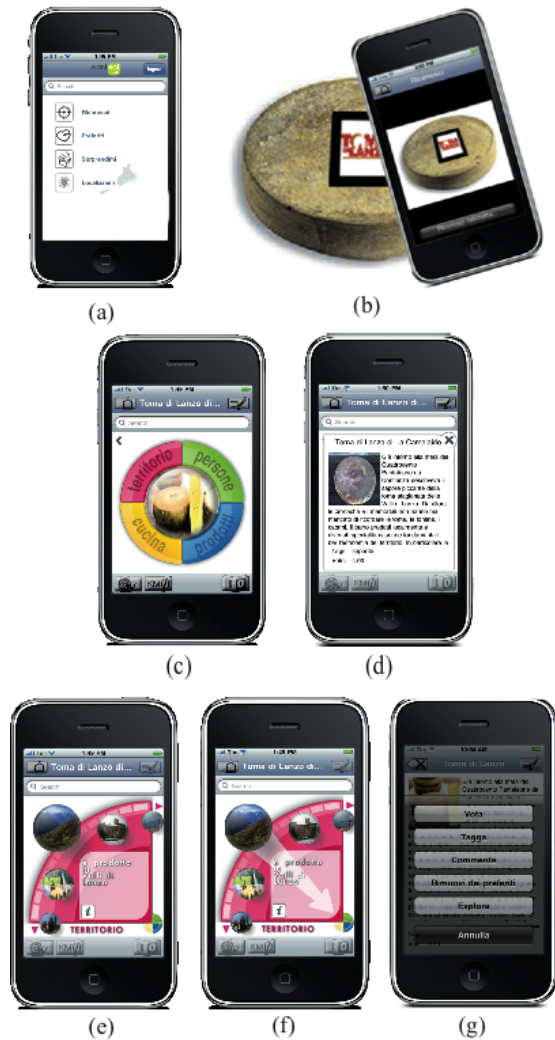
Figure 1. Example of the wheel on an iPhone

Getting a recommendation; (iv) Searching or (v) Exploring bookmarks.