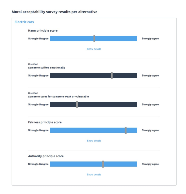
Figure 4. Screenshot results page

In the fourth and final stage the social acceptance and moral acceptability results of the debate will be presented (figure 4). The results will be available to all users which will enhance the transparency of the debate.