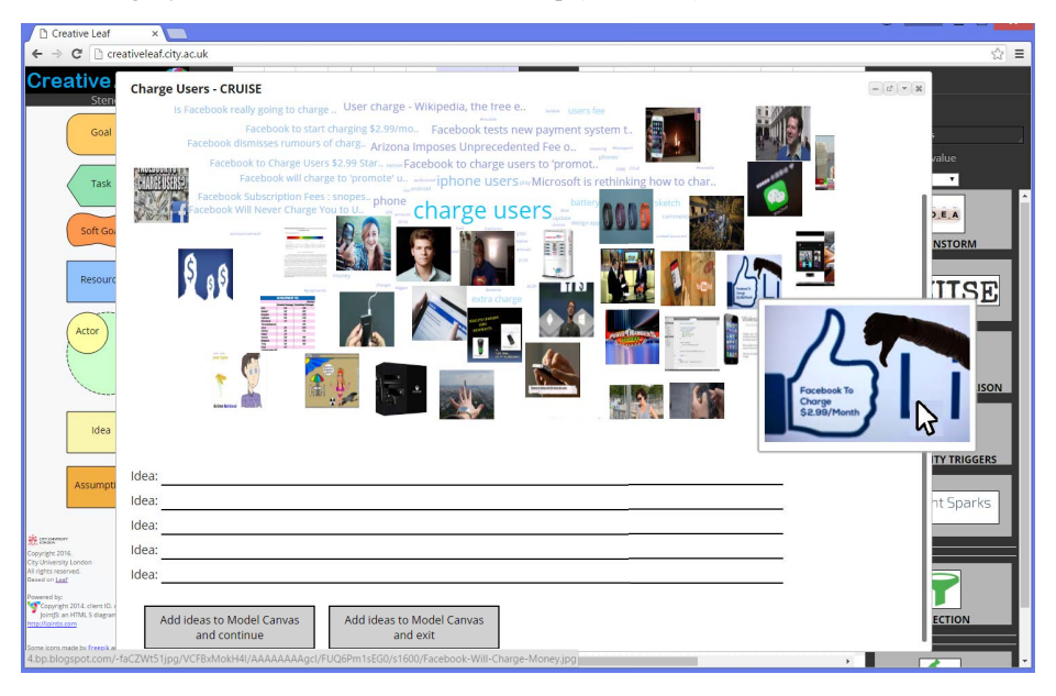
Proceedings of the Ninth International i* Workshop (iStar 2016), CEUR Vol-1674