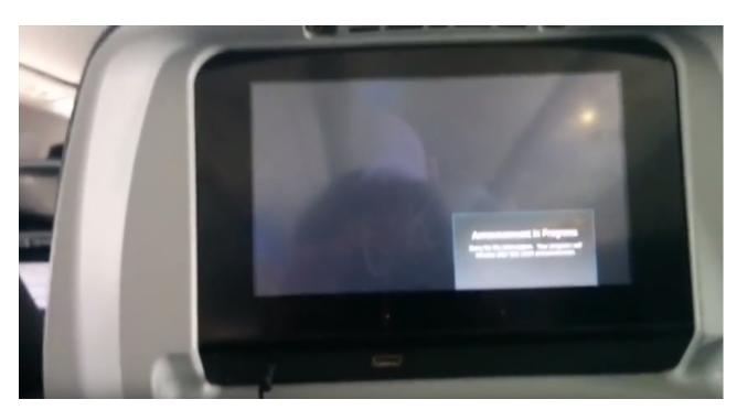
(c) The movie is stopped for an announcement.