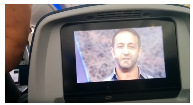
(a) The ideal situation while watching a movie on a plane.